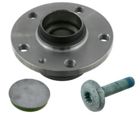
febi wheel bearing kit (23320)

The new bearing assembly and the wheel speed sensor were fitted to the car, along with the refitting of the brake assembly and wheel. Once this was completed, the steering wheel angle sensor reset could be carried out. This consisted of road testing the vehicle with an assistant to operate the diagnostic tool. This involved driving straight at no less than 20 km/h, turning the steering wheel at least 15° to the left and then to the right and then stopping the vehicle. Then, the steering was turned completely to the left and was held for at least 3 seconds, then