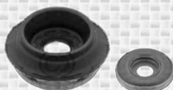
Mounting kit + bearing : MK100