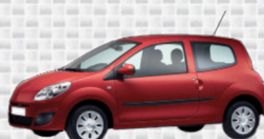
Renault Twingo II