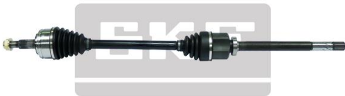
Former SKF design

The former SKF design also guarantees optimal fitting and performance.