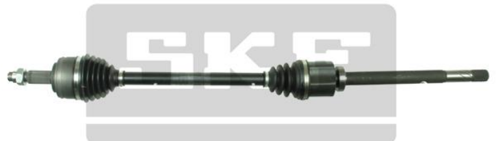
New SKF design