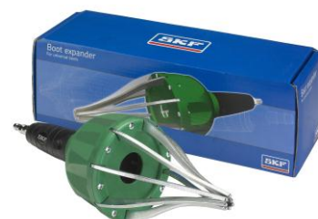
Ecarteur de soufflet : VKN 402

Pour un serrage rapide et fiable, SKF recommande l'utilisation de la pince de serrage pour colliers universels, le VKN 400. Un serrage incorrect des colliers peut provoquer une usure prématurée du joint homocinétique !