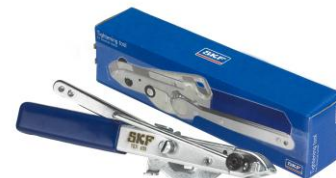
Pince de serrage : VKN 400